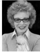
CAROLE MIGDEN D - SAN FRANCISCO