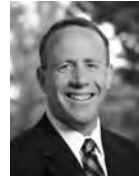
DARRELL STEINBERG D - SACRAMENTO