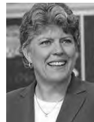
JULIA BROWNLEY D - SANTA MONICA