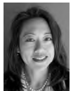
FIONA MA D - SAN FRANCISCO